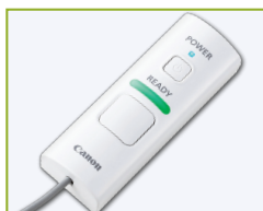
Optional Status Indicator