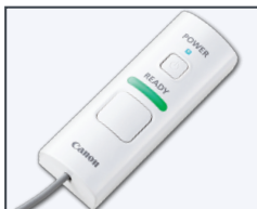
Optional Status Indicator