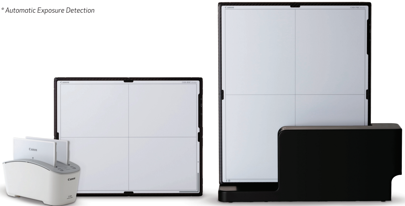
Shown with optional Docking Station, sold separately.